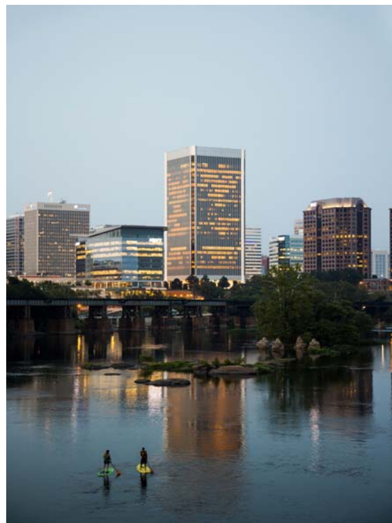
James River Skyline