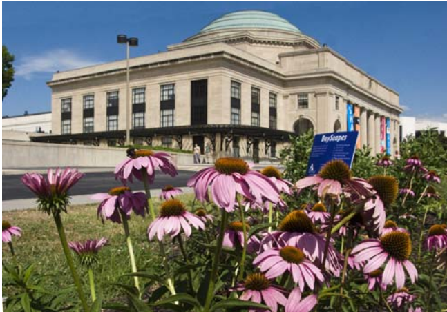
The Science Museum of Virginia